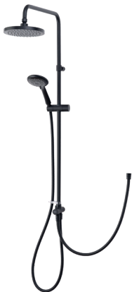
DuElec Kit Matte Black XADUKIT3